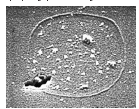
Figure 1. Punctured Barrier Junction After ESD Test at 4000 V