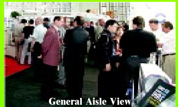
General Aisle View

Coil Winding, Insulation & Electrical Manufacturing Exhibitions