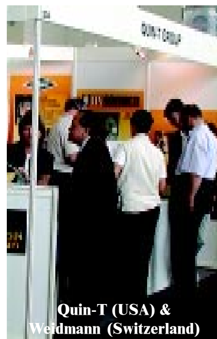
Quin-T (USA) & Weidmann (Switzerland)

■ The greatest number of coil winding, insulation & electrical manufacturing companies and products under one roof, at the biggest, dedicated event in Europe.