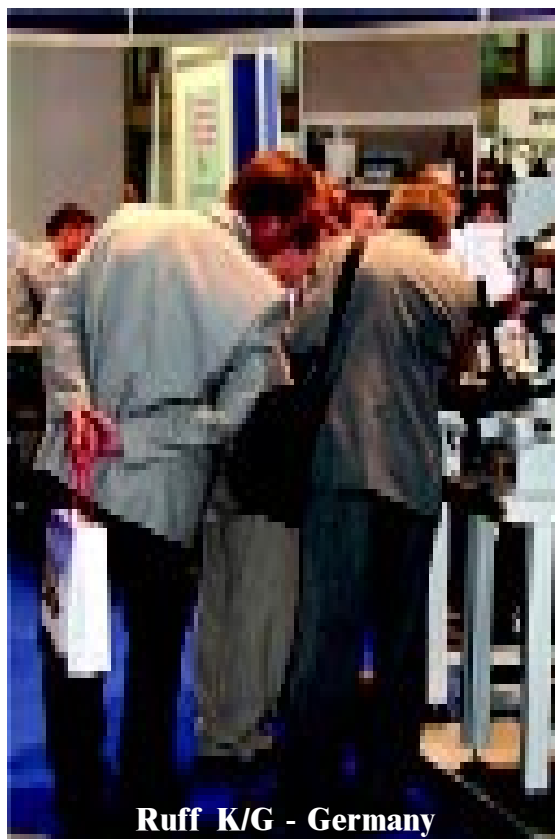
Ruff K/G - Germany

Germany , the number one location choice because it is the foremost European country in terms of manufacturing. Germany is the third largest economy in the world. Germany is the dominant economy in Europe, generating nearly 30% of the total Gross Domestic Product of the European Union.*