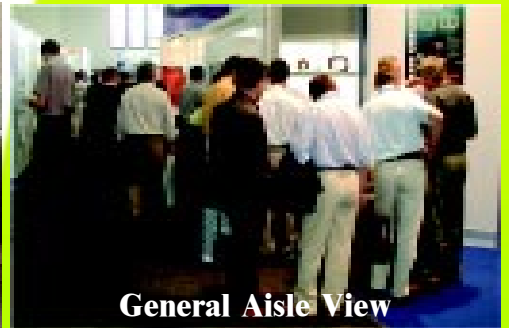
General Aisle View