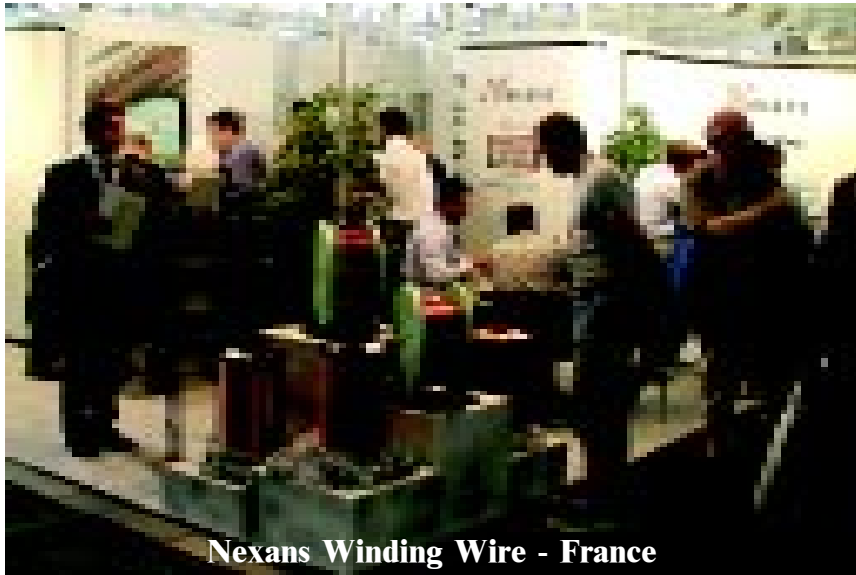
Nexans Winding Wire - France