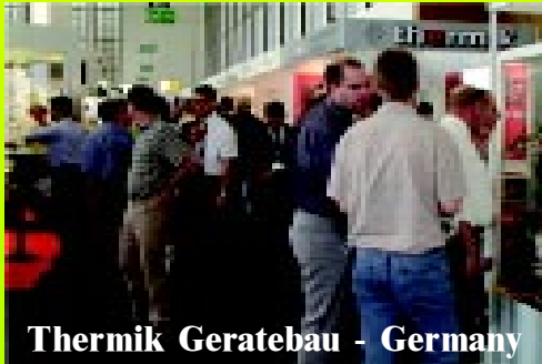
Thermik Geratebau - Germany

Sponsored by Coil Winding International & Electrical Insulation Magazine