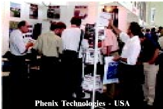
Phenix Technologies - USA