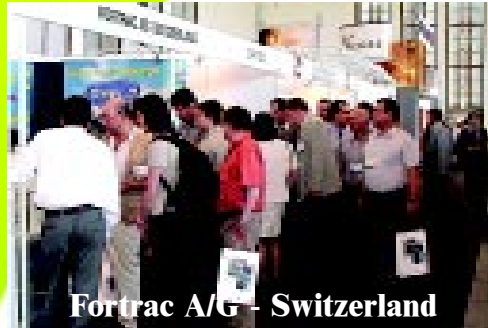
Fortrac A/G - Switzerland